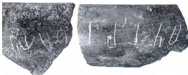
Tamil-Brahmi inscriptions. Several pieces of pottery have inscriptions in Brahmi, which was used to write Tamil.

was found at the site. Other finds include pottery from the Mediterranean region, such as amphorae (tall double-handled jars that contained liquids such as wine or oil) and stamped red-glazed pottery, known as Arretine Ware, which was named after a city in Italy. This was made by pressing wet clay into a stamped mould. There was yet another kind of pottery which was made locally, though Roman designs were used. Roman lamps, glassware and gems have also been found at the site.